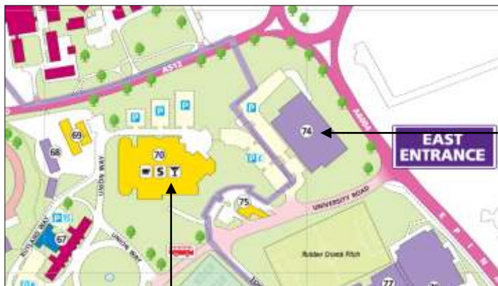
Student Union Building